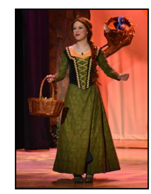
"Not only do you get to see quality high school productions, you don't have to worry about getting good seats!"