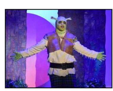
"Lakota West Theatre is a program that very successfully develops, nurtures, and displays the talents of young people...a pretty good recipe for support."